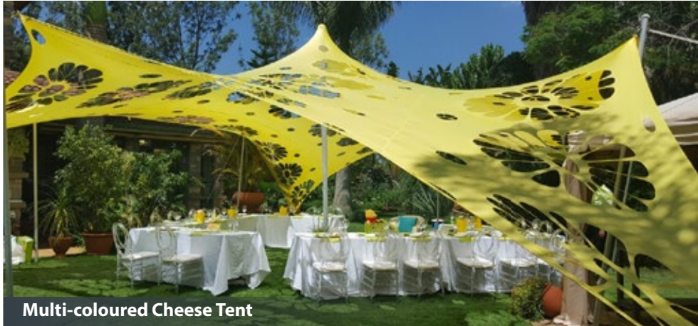
Multi-coloured Cheese Tent