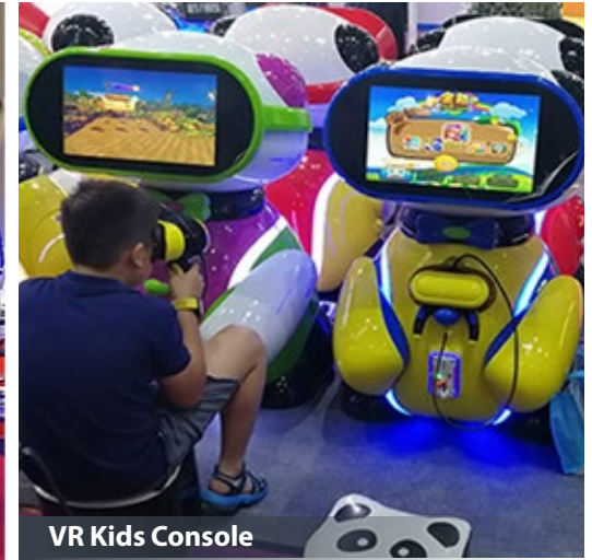
VR Kids Console