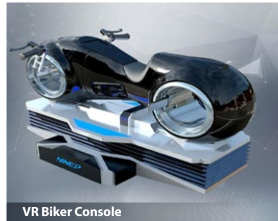
VR Biker Console