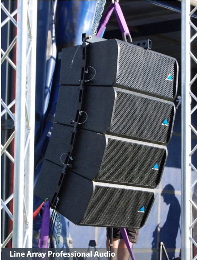
Line Array Professional Audio

An extensive inventory of processors, line mixers, effect processors, microphones and indoor ambience lighting for just about any corporate event.