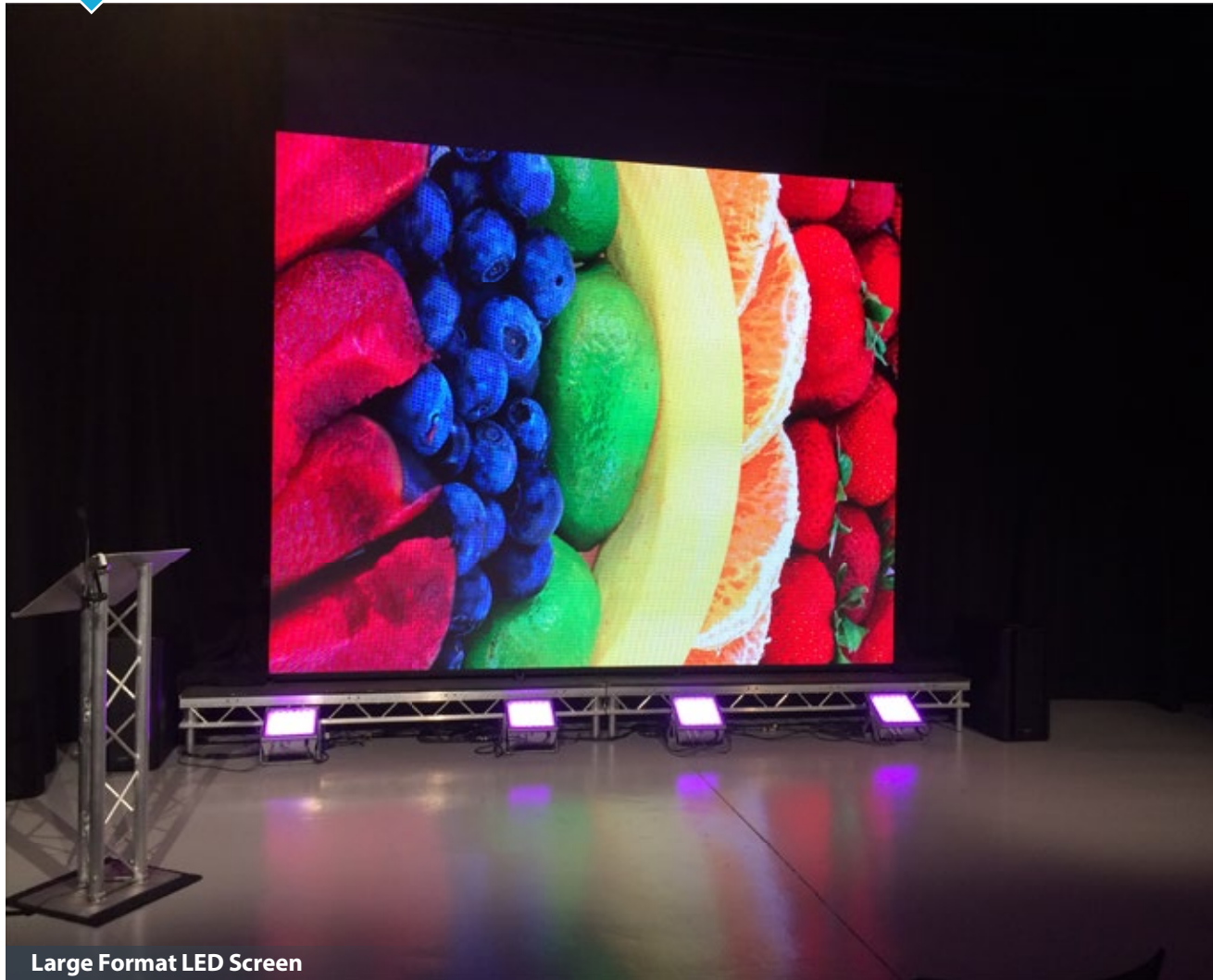
Large Format LED Screen