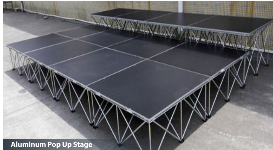
Aluminum Pop Up Stage