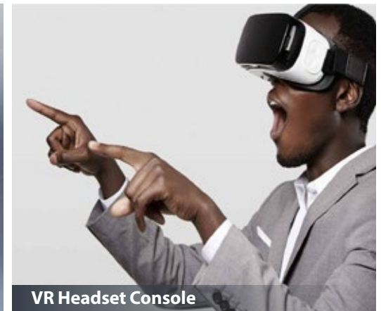
VR Headset Console