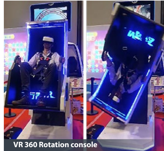
VR 360 Rotation console