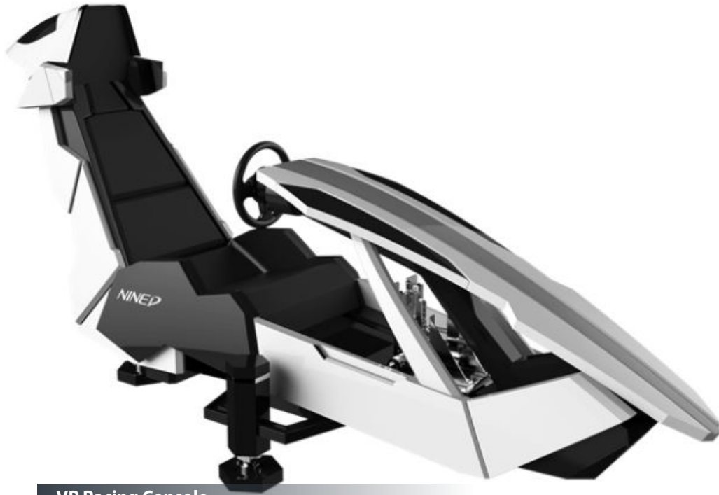
VR Racing Console

Using VR content and gear we indulge your audience with a truly immersive and intuitive experience. We have put together a suite of solutions to deliver the thrill of virtual reality .